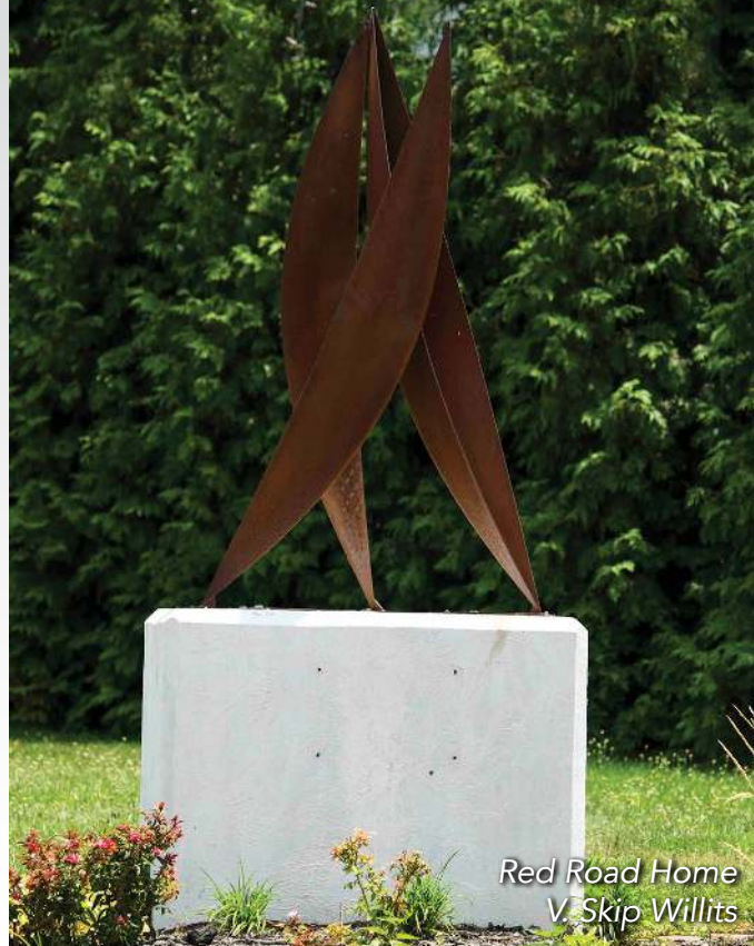
Red Road Home V. Skip Willits